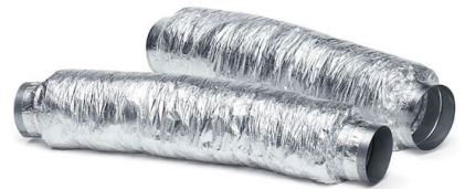
Flexible silencing canalization 9700 603